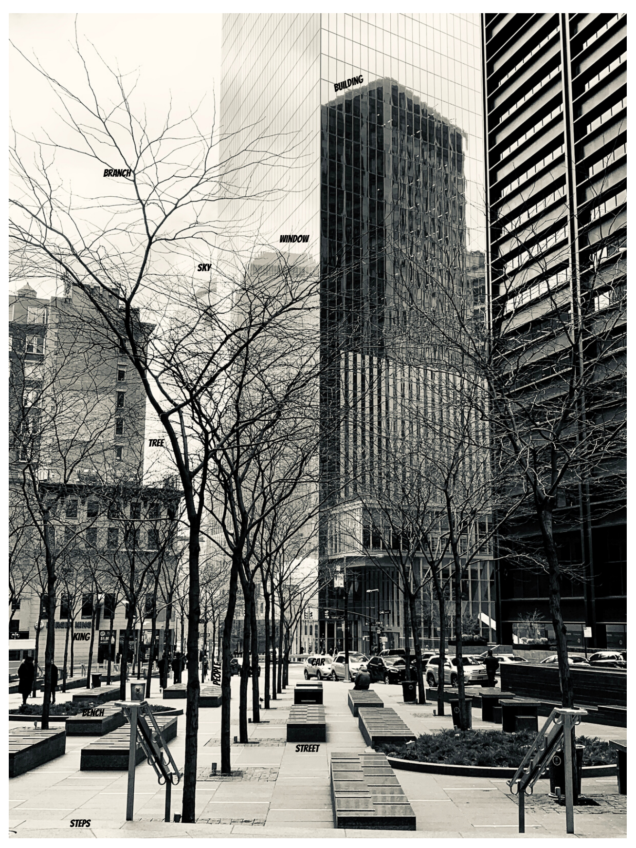
tree - street - bench - sky - building - car - window - steps - people - king - branch